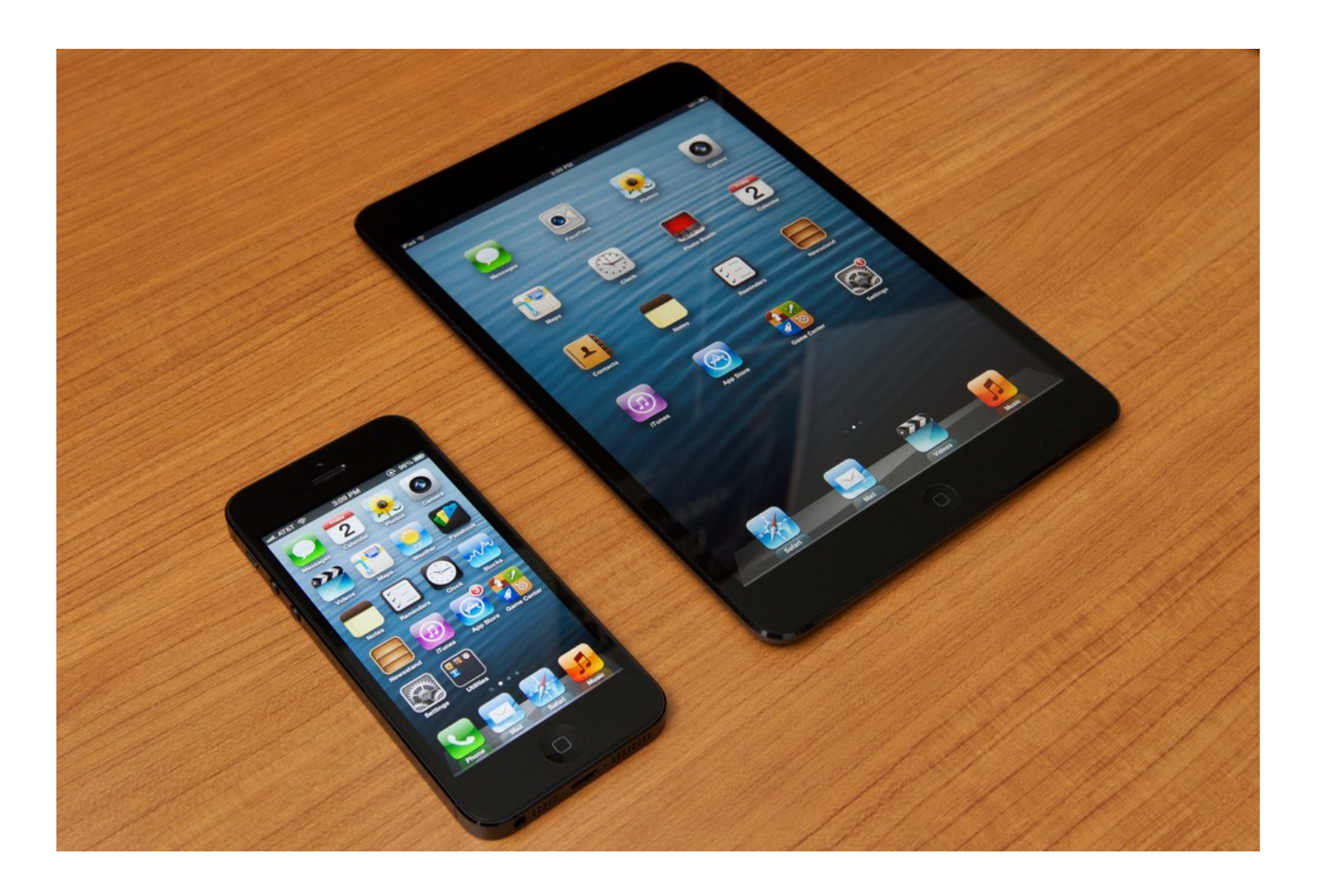
iPhone 5 & iPad mini