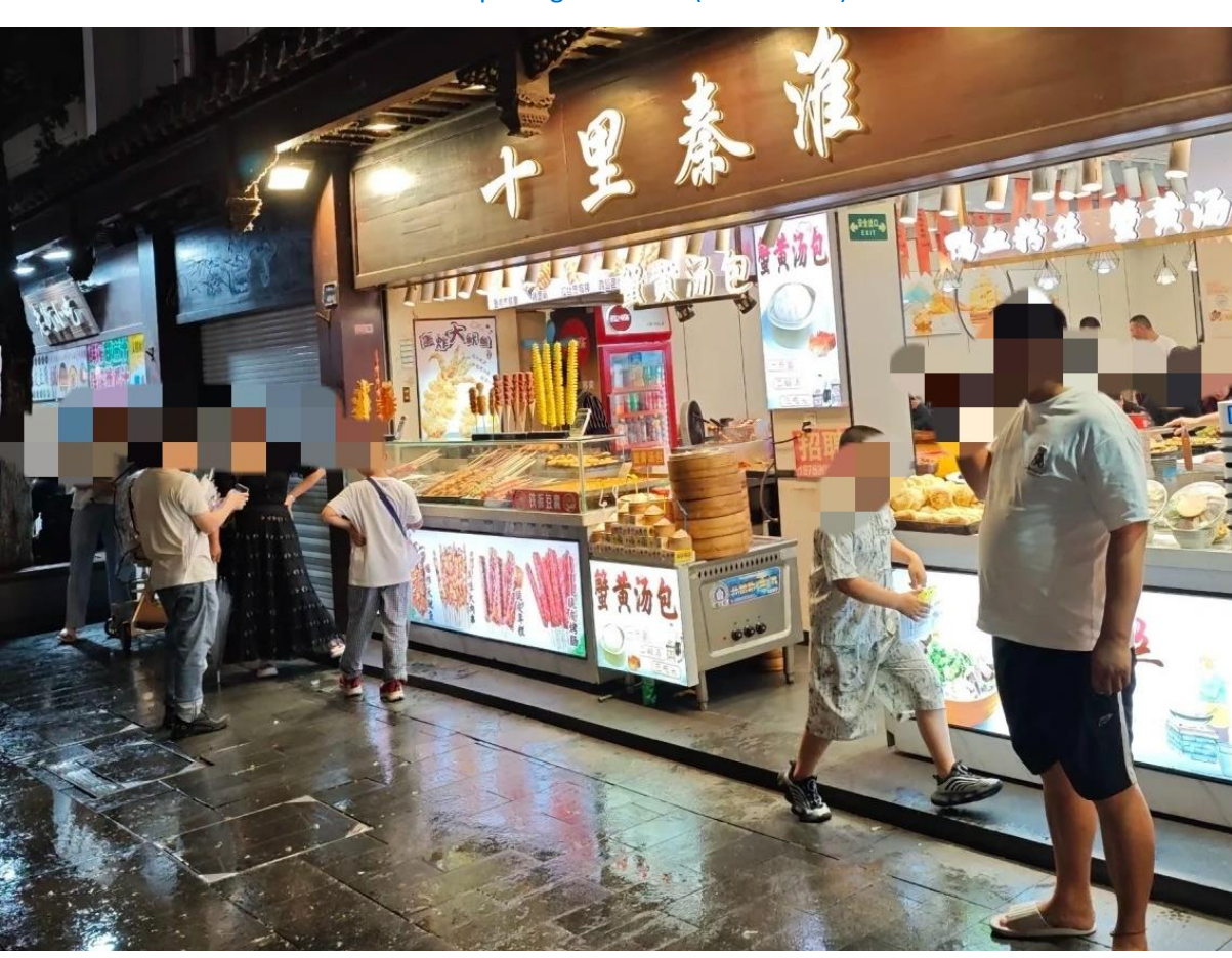
Picture 1: A food stall at Confucius Temple Night Market

The basic supporting facilities of the Confucius Temple Night Market are very complete. There are many public toilets in the night market area, and the locations are clearly marked. The garbage cans in the night market area are also densely distributed, and there are cleaning staff to patrol and clean up the garbage on the ground to ensure a clean environment. The night market also has some benches for people to rest. People who drive can use the parking lot of the Confucius Temple scenic area. In addition, the management of the night market also appears to be very orderly. Security personnel and market managers wearing red armbands can be seen patrolling from time to time. However, I also found some problems during the observation. Firstly, there are fewer street lights in the Laomendong Night Market, which is relatively dim. In addition. There are many people queuing in front of some stalls, which blocks the road.